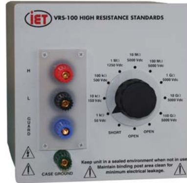
Model VRS-100 High Resistance Standards, rotary switch style, with guard and case ground